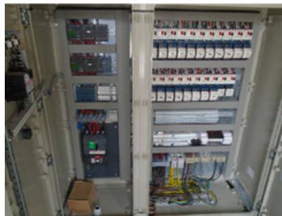
Electrical panel with SCADA system. SCADA performs automatic monitoring, protecting and controlling of the WWTP.