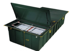
Orenco's AdvanTex® AX100