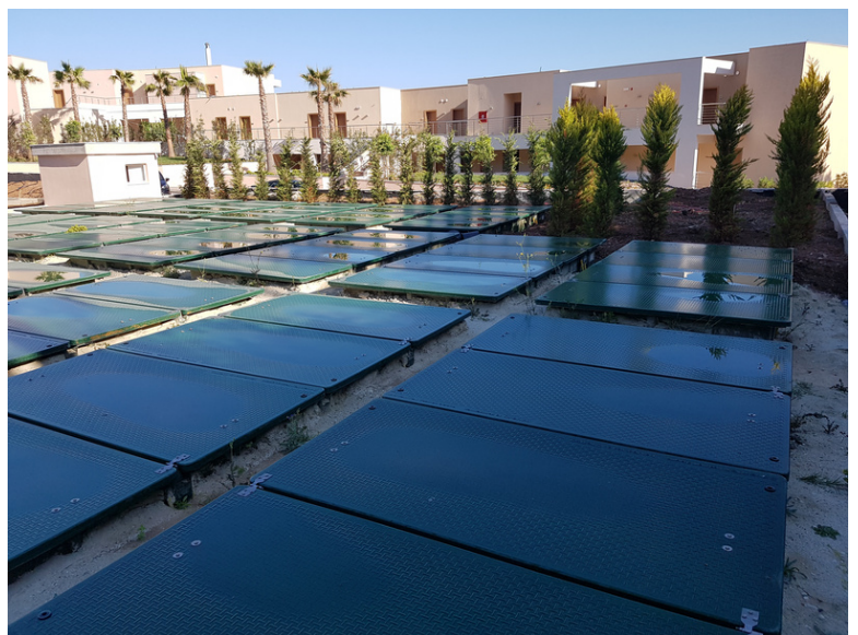
View of the WWTP after completing installation.