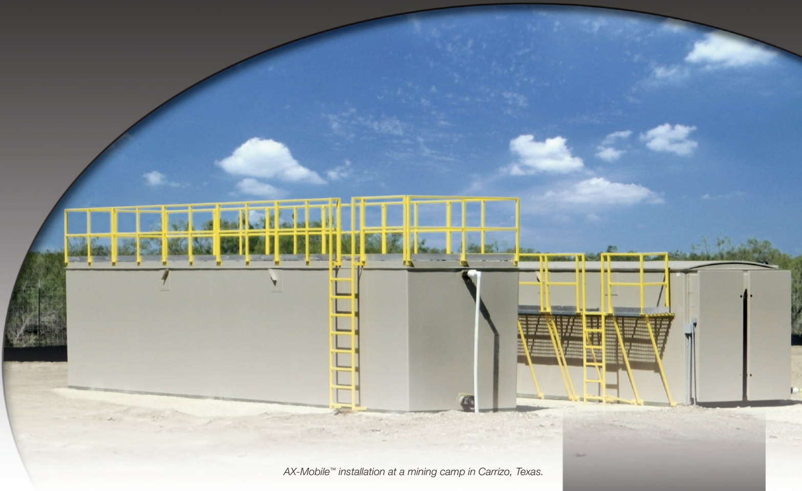
AX-Mobile™ installation at a mining camp in Carrizo, Texas.